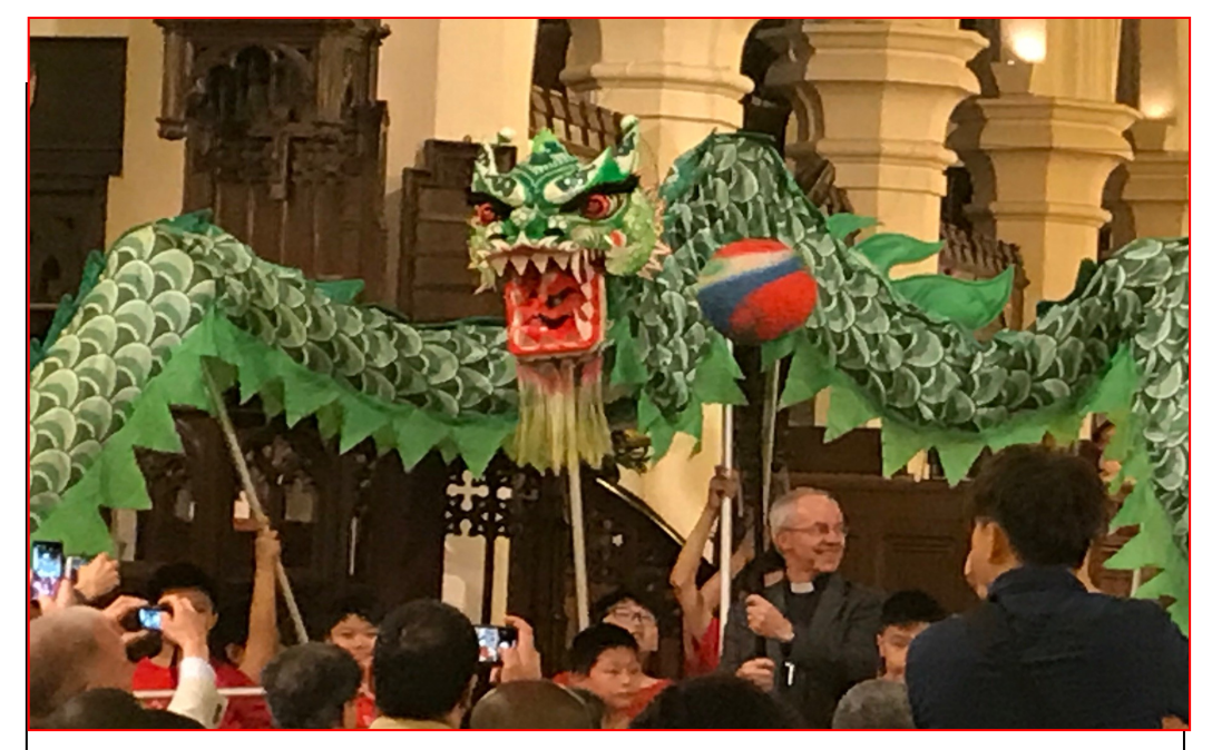
Celebrations with Dragons at the final service at Holy Trinity Cathedral Hong Kong

Chair IAWN Steering Group; Archdeacon of Auckland