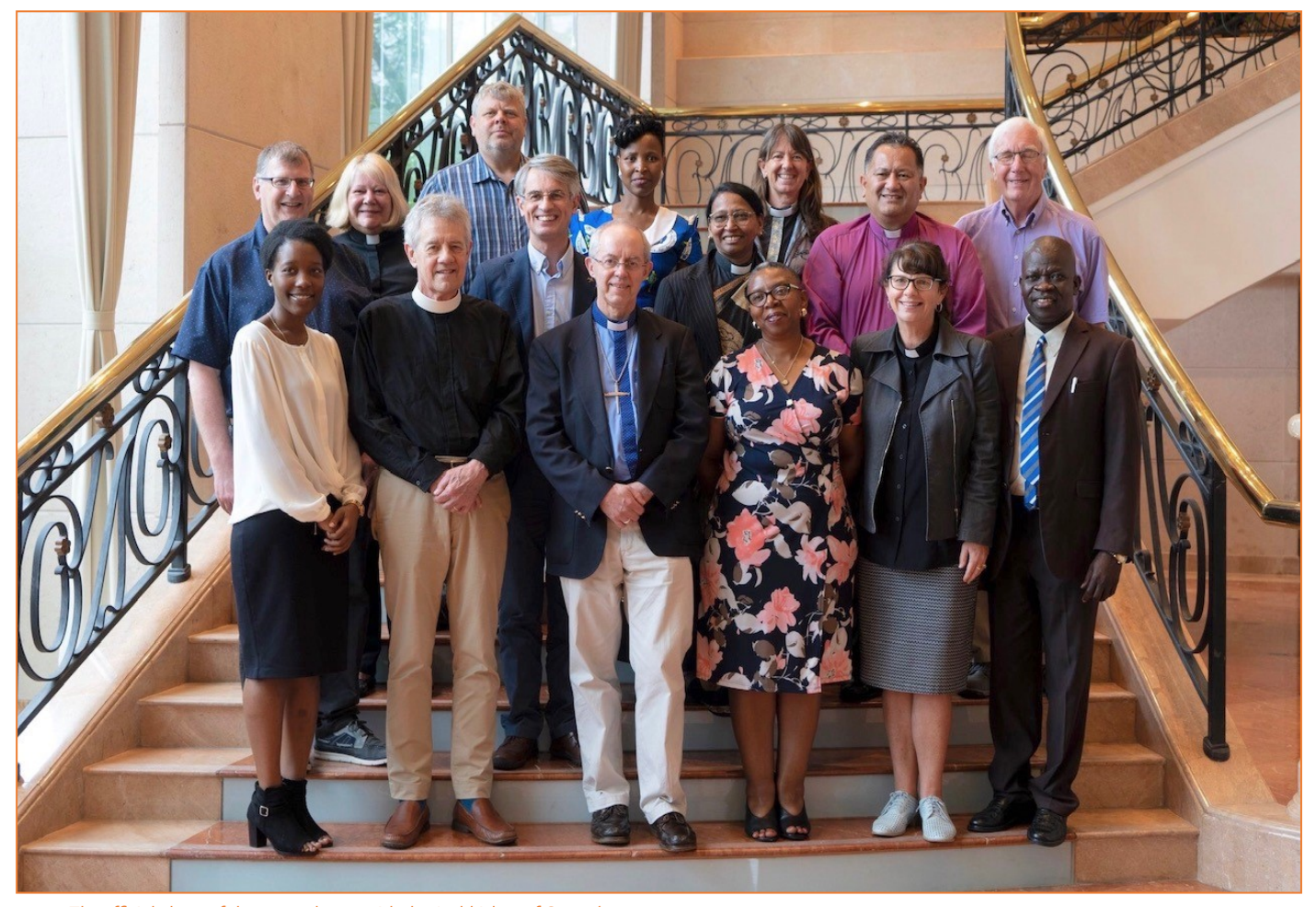
The official photo of the network reps with the Archbishop of Canterbury