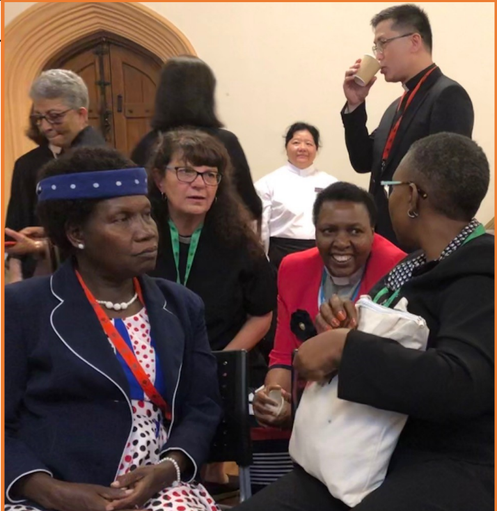
Women networking about IAWN representation

+Supporting women's sustainable economic empowerment and entrepreneurship, including gender budgeting and auditing.